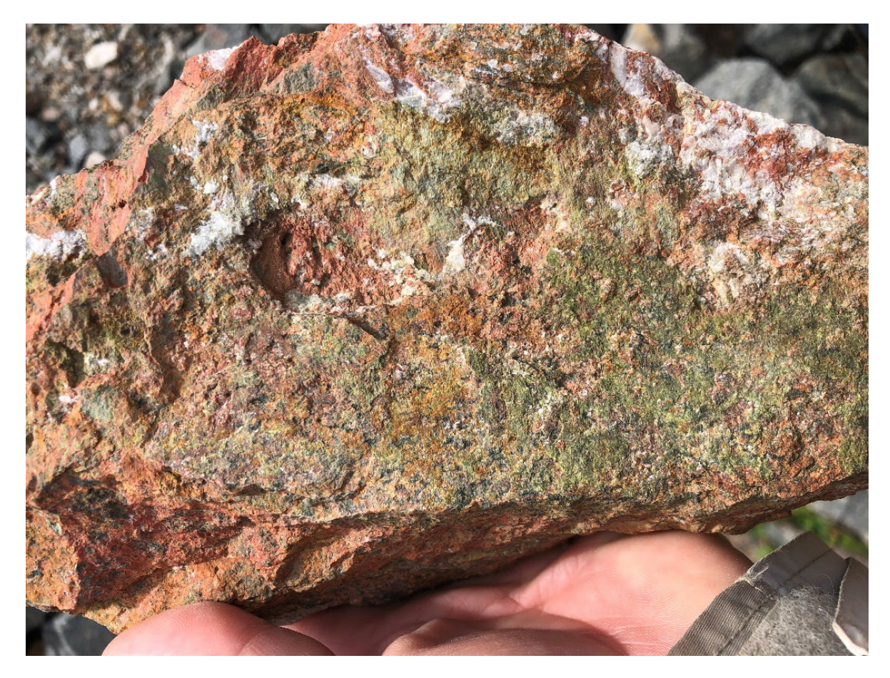
Figure 3: Epidote quartz veined and red rock altered granite sample from Yundamindra shaft waste dumps.